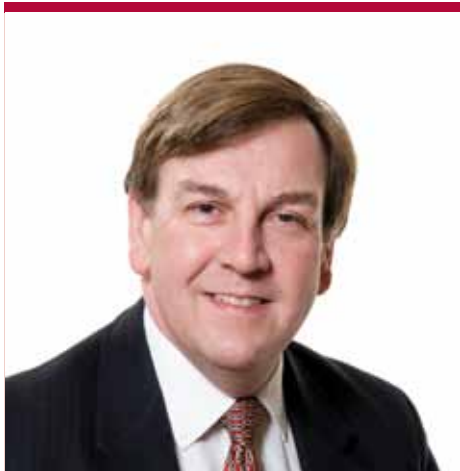
John Whittingdale OBE, MP

Entering Parliament in 1992 as the MP for South Colchester and Maldon (now simply Maldon), John has been a constant and consistent supporter and friend, albeit critical one when needed, to the many industries which depend on IP. This interest has been clearly enhanced by the roles John has taken on throughout his parliamentary career. Starting off as a special adviser, grappling with issues such as the blank VHS tape levy, in what was then the DTI, John's time in Parliament has included a stint as the Shadow Secretary of State for Culture, Media and Sport and, since 2005, Chair of the Culture, Media and Sport Select Committee. These roles have put him at the forefront of developments in IP policy. John even promoted an Alliance-initiated Private Members Bill in 2005 to stop counterfeit goods being sold at markets. While ultimately unsuccessful, this Bill was instrumental in keeping this important issue at the forefront of the Government of the day's mind.